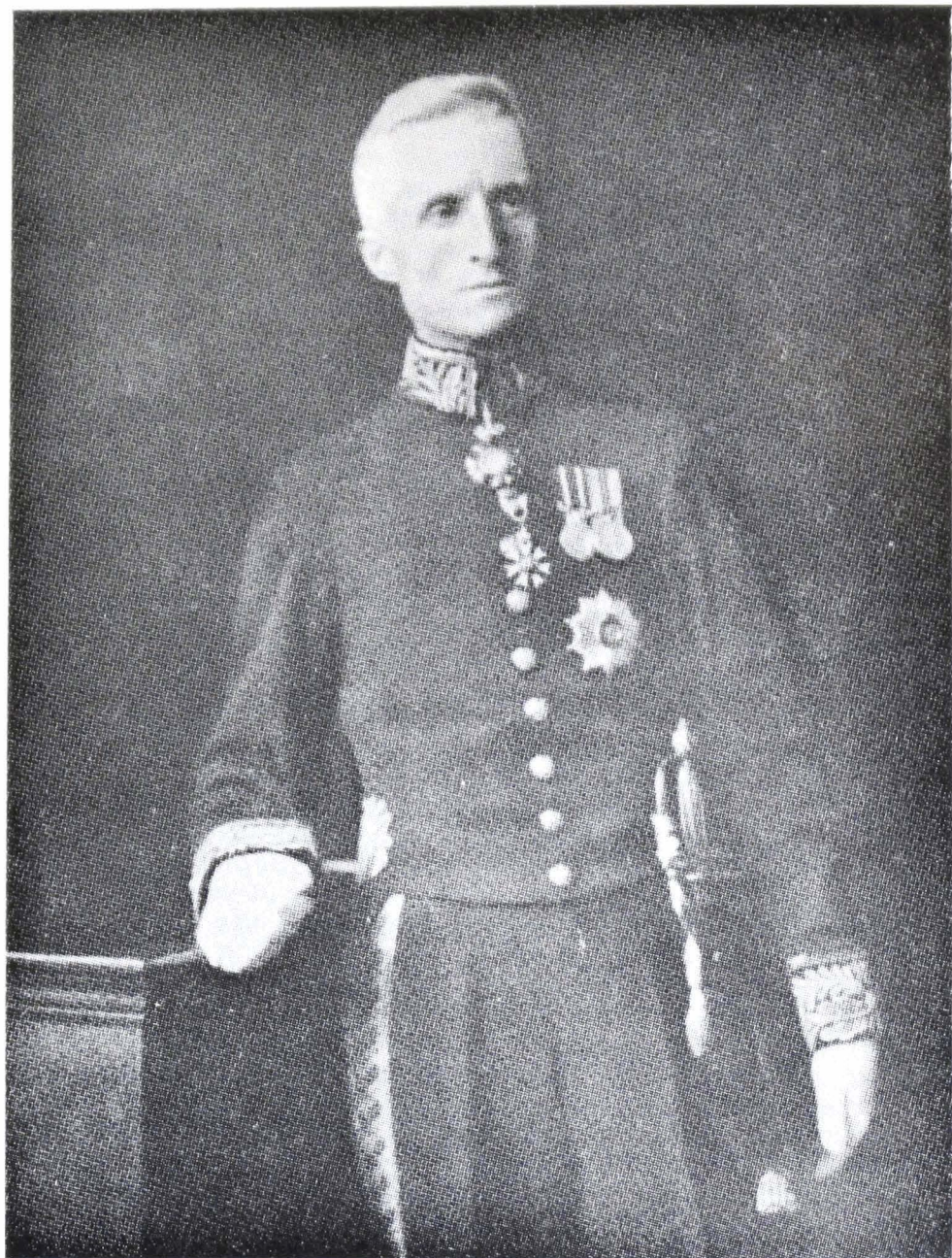
SIR CHARLES BELL