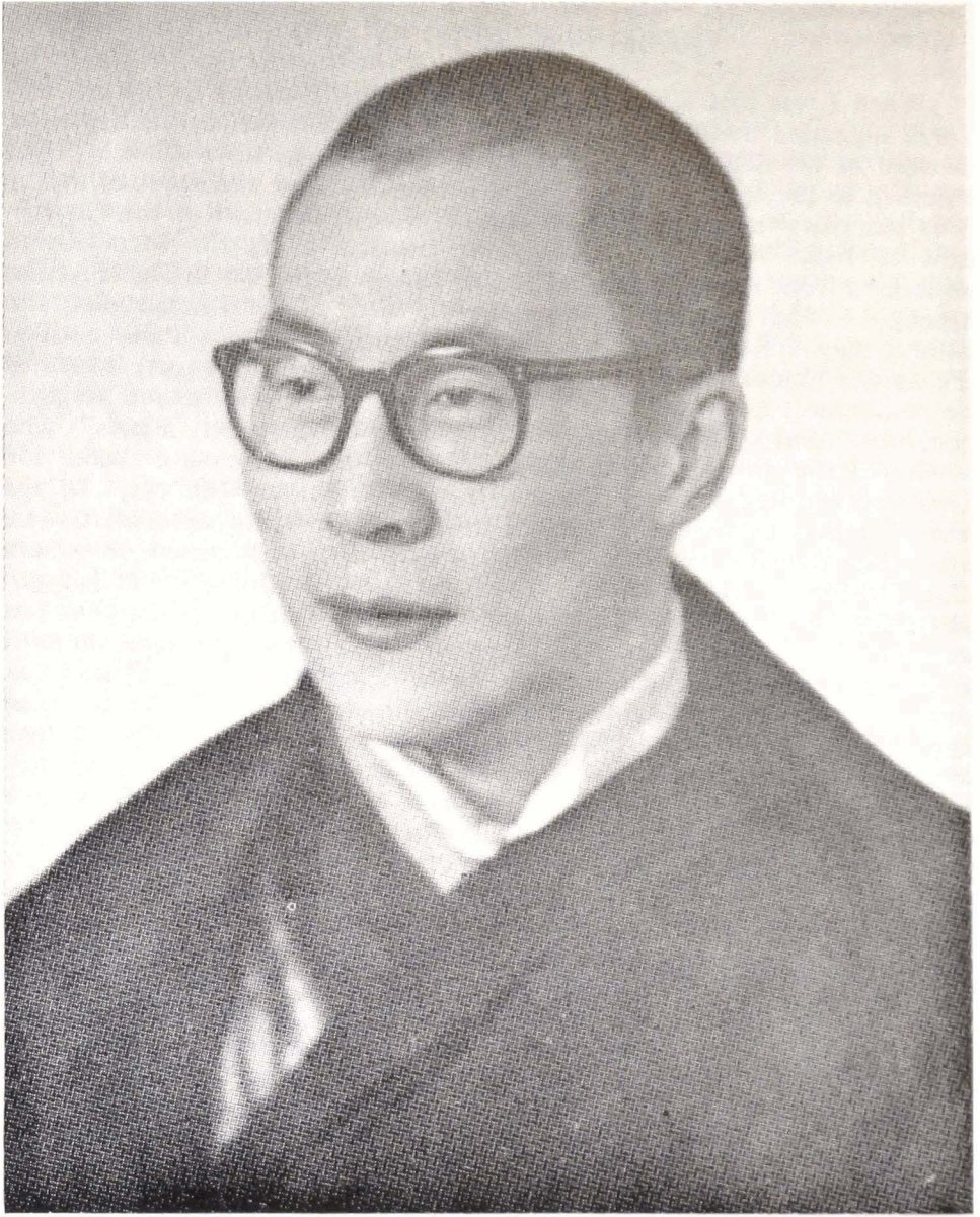
THE FOURTEENTH DALAI LAMA