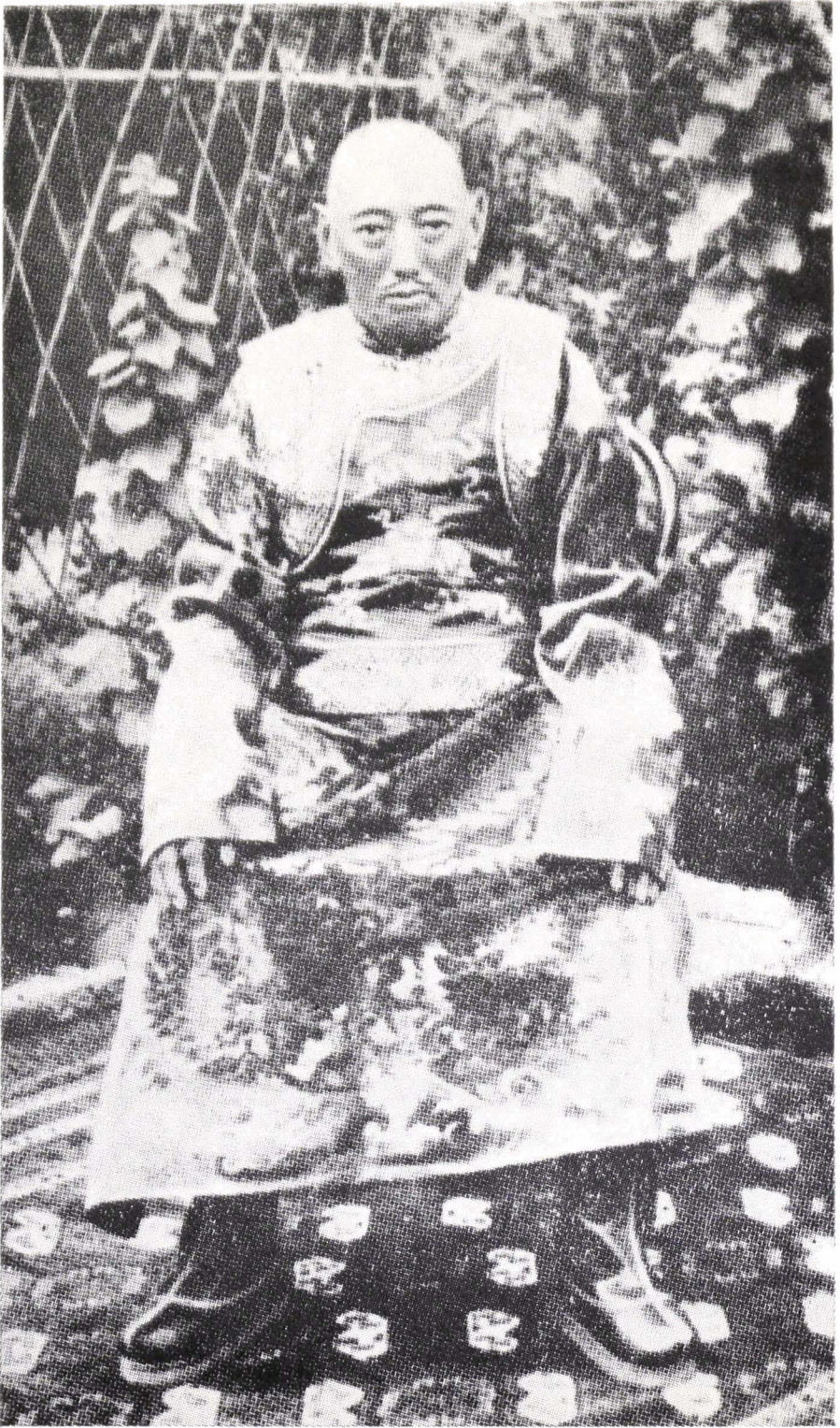
THE THIRTEENTH DALAI LAMA