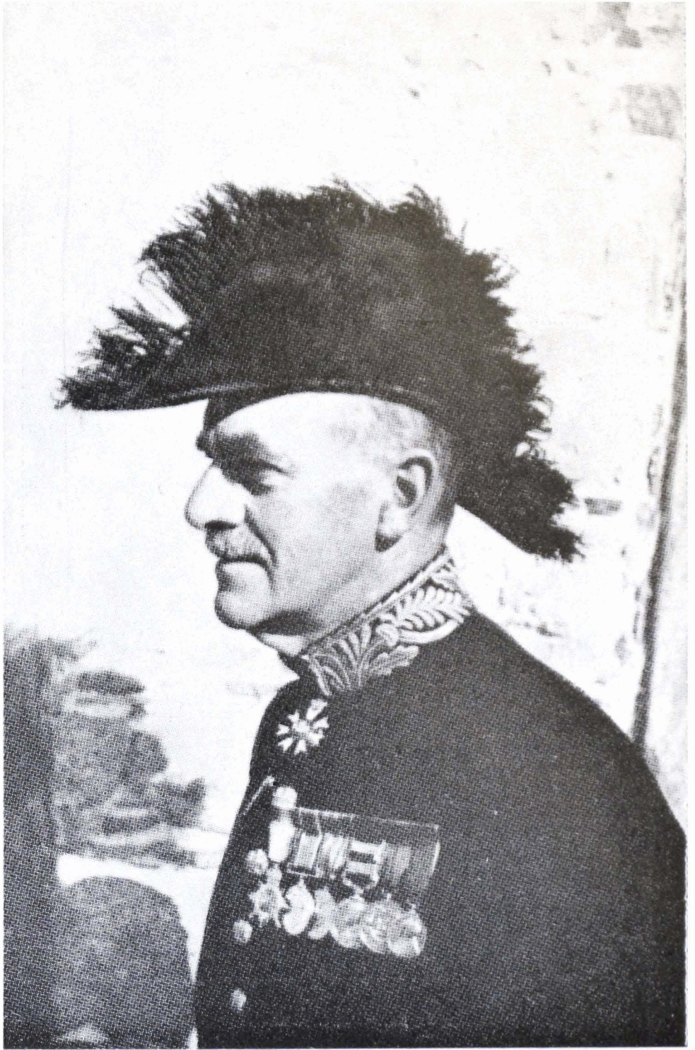
SIR BASIL GOULD